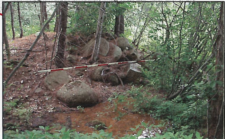
Right: The constructed berm of the Campbell Mill Dam viewed east. The low, wet area in the foreground is thought to be the location of the wheel pit or a race canal.