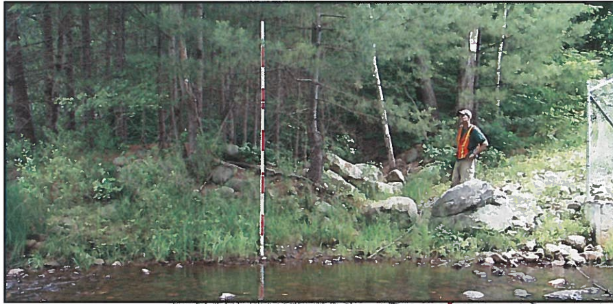
Left: The constructed berm of the Campbell Mill Dam viewed from the left bank of the stream.